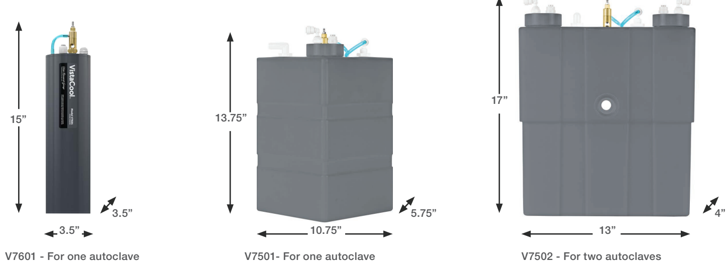
Note: Optional, adjustable tank stands raise the installed height of V7501 & V7502 models between 1/2" and 5" in half-inch increments. Order S7545 for V7501; order S7547 for V7502.