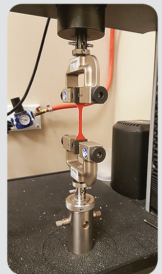
Figure 2. Tensile strength testing with Instron 5866