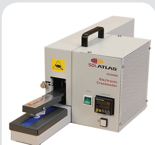
Figure 1: SDL Atlas Electronic Crockmeter

* SDL Atlas electronic crockmeter is a piece of instrumentation certified for use in standardized testing methods for colorfastness of textiles. It was designed to simulate the action of a human finger and forearm using a standardized pressure and motion to provide reliable and reproducible test results.