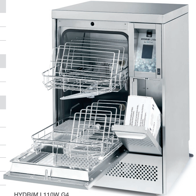
HYDR/M L110W G4 also available